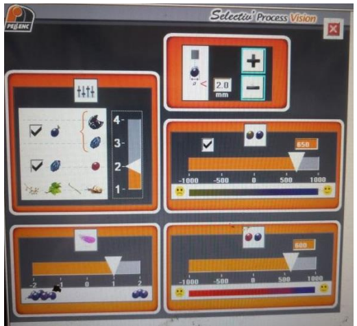
Figure 2. The operator set the parameter of the Pellenc sorter, de-stemmer, and Selectiv' Process Vision. These parameters were the same as normal operations.

The number of MALB per collection point was determined and then the fruit was pressed with a small bladder press to 2 B. A 0.5 mL sample of juice was collected and submitted to CCOVI lab services for analysis of methoxypyrazines using headspace SPME GC-MS and a stable isotope dilution assay.