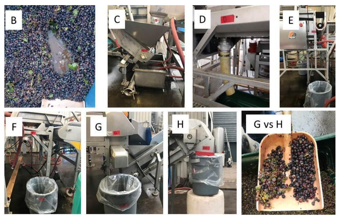
Figure 3. Sampling points: A not shown; B = inoculated grapes in bin (pre-sorting); C = free run juice collected from hopper; D = waste from crusher; E = post mechanical sorter solids; F = post mechanical sorter liquids; G = post optical sorter, rejected; H = post optical sorter, accepted; G vs H = post optical sorter rejected (left) and accepted (right)

Figure 2. The operator set the parameter of the Pellenc sorter, de-stemmer, and Selectiv' Process Vision. These parameters were the same as normal operations.