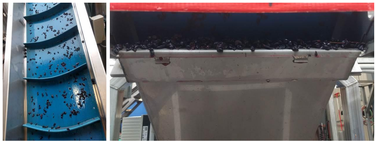
Figure 4. Grape material left on the sorting line after the machine was turned off.

The primary challenge we experienced with this project was limited access to the sorting equipment. For example, due to scheduling challenges, it was not possible to do the trial on multiple varieties, including whites. It was also not possible to examine the equipment to look for unrecovered MALB. As previously mentioned, across all replicates only 16% (19 of 120) of MALB were recovered. This poor recovery makes it difficult to evaluate the effectiveness of the optical sorter. We suspect that the majority of MALB remained in the sorting equipment as we observed a significant amount of grape material stuck throughout the machine after each replicate was processed (Figure 3). The volume of each replicate (100 kg of fruit) is relatively small considering the size and processing capacity of the equipment.